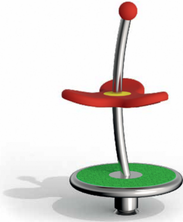
Diagram 1: Overall view of the play equipment