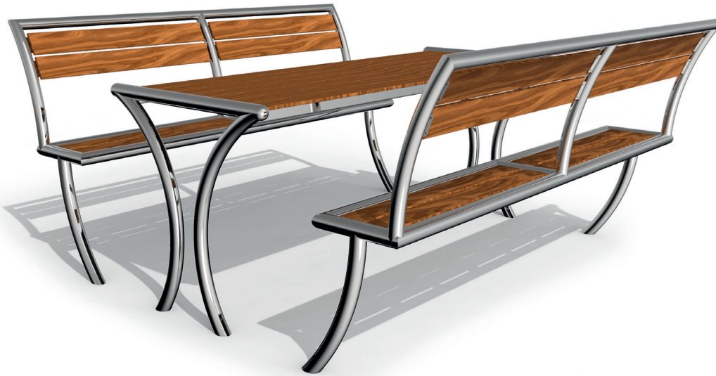
Diagram 1: Overall view