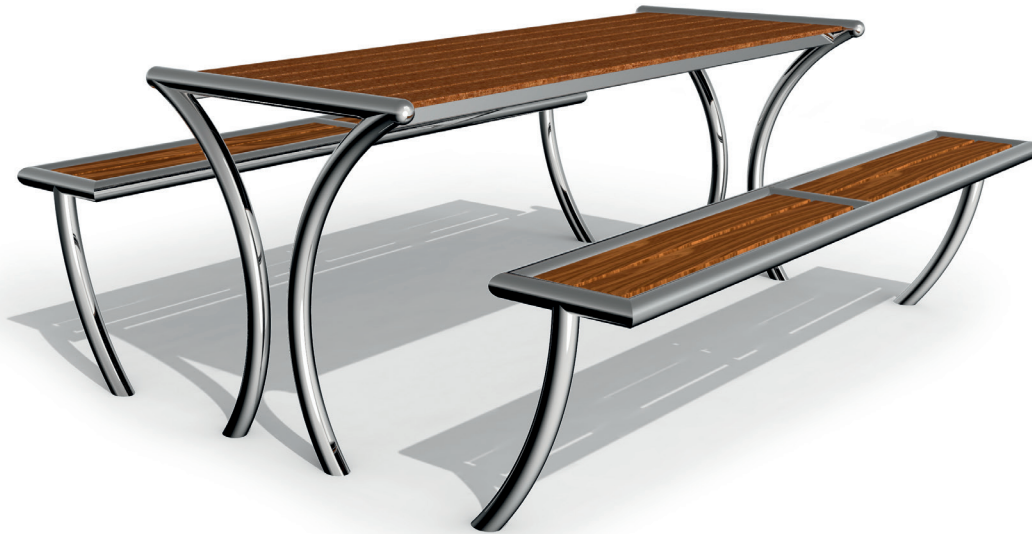
Diagram 1: Overall view