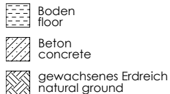
Diagram 2: Foundation plan