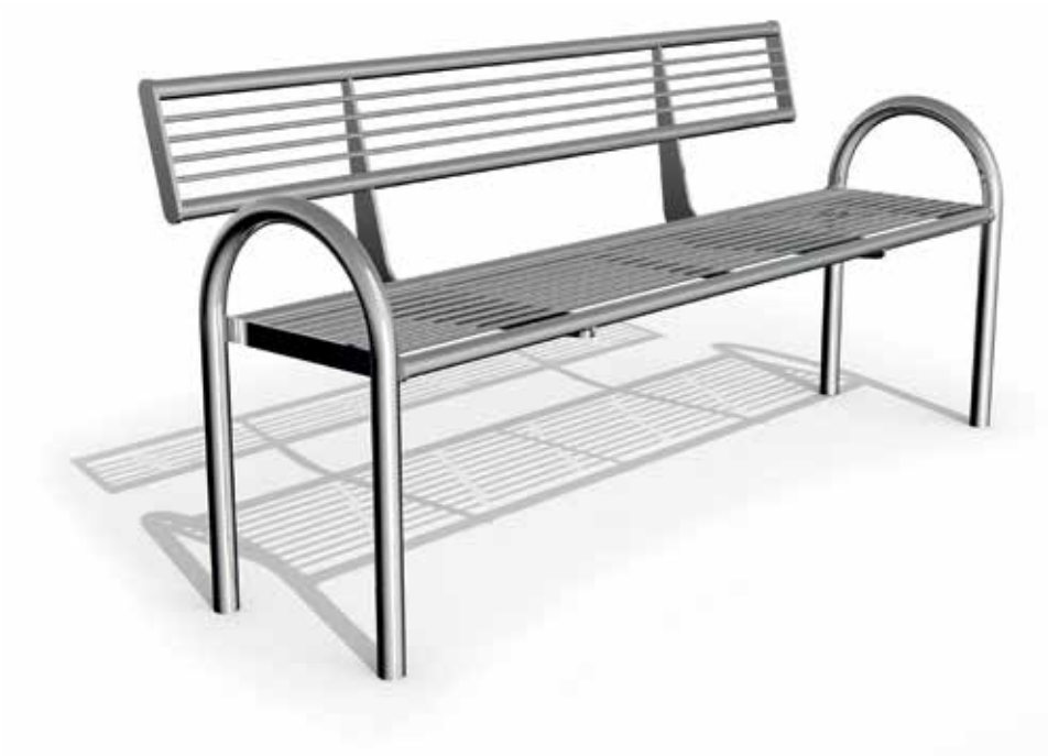
Diagram 1: Overall view