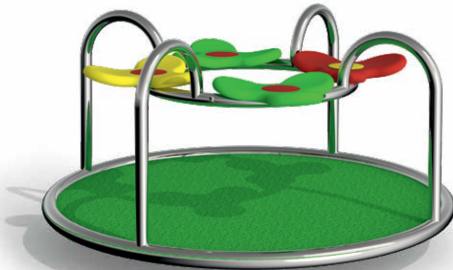
Diagram 1: Overall view of the play equipment