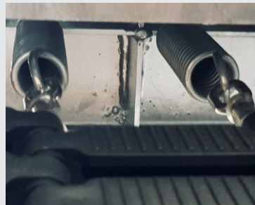
installation situation springs/ jumping mat on eye-screw side of the mat